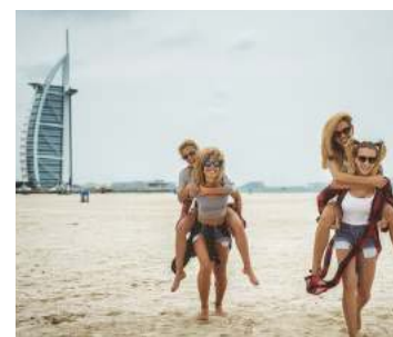
Summer Fun in Dubai