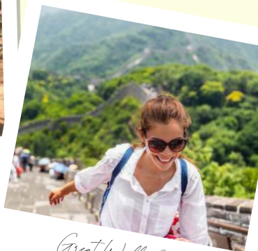
Great Wall, China