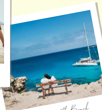
Relaxing on the Beach