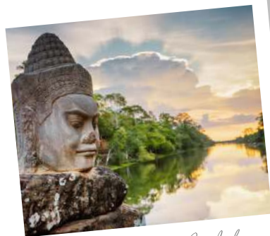
Stone face Apsara, Cambodia