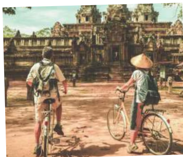
Angkor Temple, Cambodia